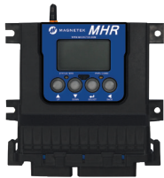
MHR RADIO CONTROLLER

Setting a new standard in performance, dependability, and value, the inteleSmart2 Receiver is well suited to a variety of applications and industries. It can be customized with several frequency options, analog and digital inputs, and has the ability to add additional relays if required.