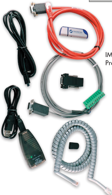
IMPULSE®•Link 5 Professional Kit